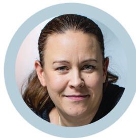
Maria Wetterstrand #1 – Green & Clean Transport Miltton Purpose

Executive Director of Miltton Purpose, biologist and former Member of Parliament in Sweden, Maria Wetterstrand has been involved in the environmental cause since she was 14 years old. At the age of 27, she entered politics and became co-leader of the Green Party. After 10 years in politics, she moved to Finland and worked as an independent. She was then recruited by Miltton Purpose, a major consulting firm. With her expertise and environmental commitments, Maria Wetterstrand is an active opinion leader and sustainable development expert.